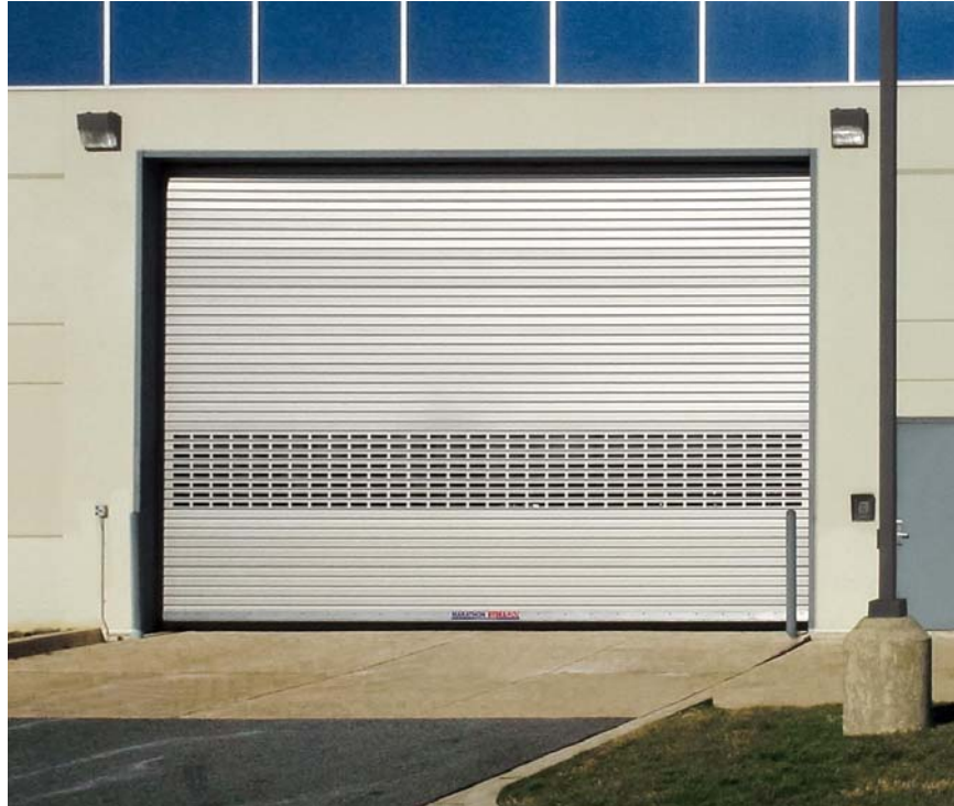
Innovative Design. Superior Performance. Exceptional Value.

High Speed - Extra Large High Performance Roll-Up Door - Direct Drive MODEL 109D POWER