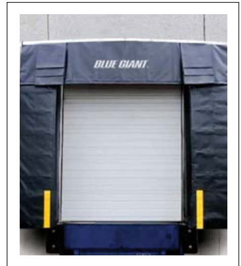
BGDSHF Foam Dock Shelter