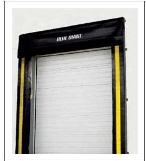
BGDSC Head Curtain Dock Seal