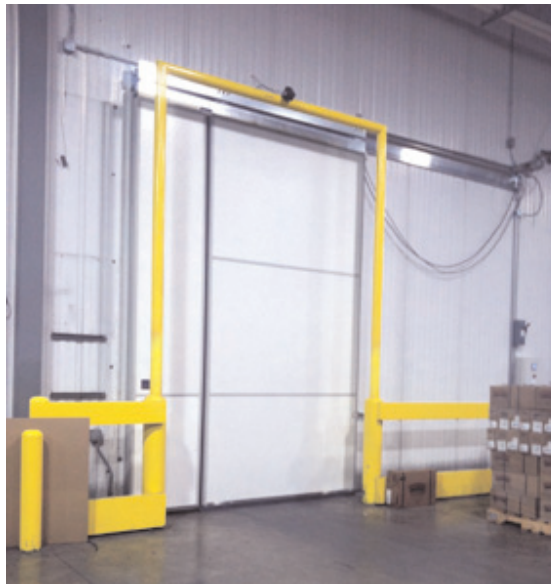
Power Model shown.

Designed for high cycle operation, every aspect of the IXP door was engineered to eliminate maintenance and downtime. The entire door system requires no lubrication and has no metal-to-metal contact eliminating wearing surfaces. The door's complete gasket release travel design, no wood construction, simple quick connect heat, and one-piece gasket system, virtually eliminates maintenance.