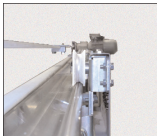
STANDARD XP SERIES HEADER AND RAIL ASSEMBLY