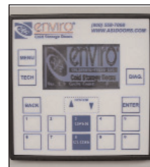
DIGITAL DISPLAY WITH SELF-DIAGNOSTICS