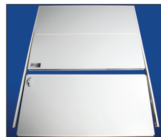
OPTIONAL REPLACEABLE BOTTOM PANEL SECTIONS