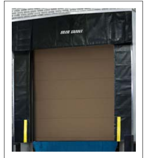
BGDSHS Stationary Dock Shelter