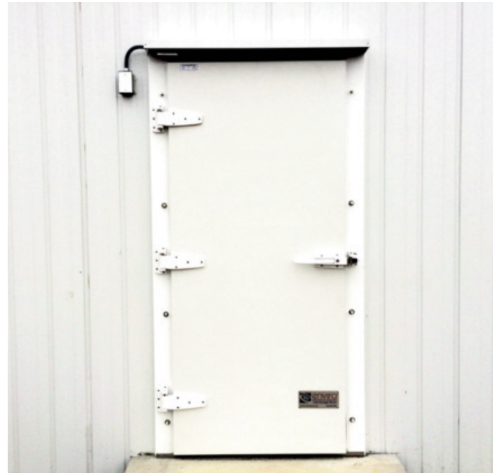
Freezer door shown with optional powder-coated hinges and rainhood.

Designed for high usage operation, every aspect of the 413 series door was engineered to eliminate maintenance and downtime. The entire door system requires no lubrication, simple quick connect heat, no wood construction and one piece gasket system, virtually eliminates maintenance.