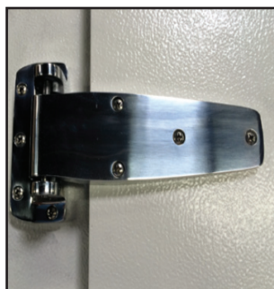
CAM LIFT HINGES