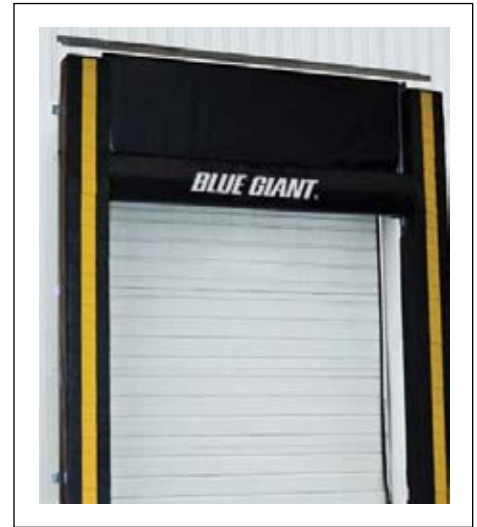
BGDSA Adjustable Head Pad Dock Seal