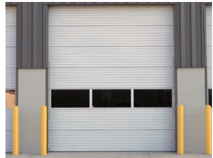
Aluminum full view sections allow for maximum natural light and visibility