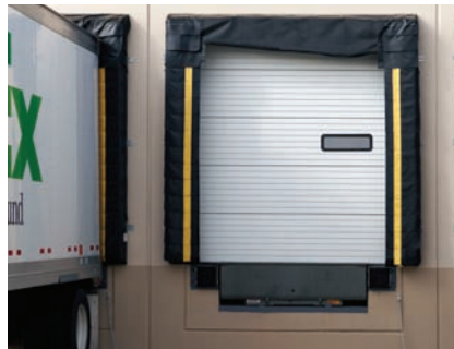
Vision Lites allow for visibility while maintaining security