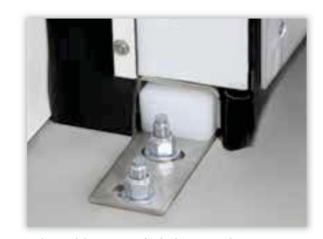
Adjustable Concealed Floor Guide System