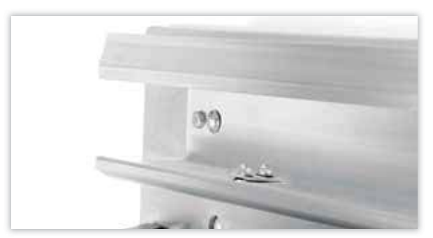
Extra Heavy Duty (EHD) Track System

ColdGuard Heavy Duty Rollers incorporate a built in anti-derail design that insures that the door system remains on the track and operational. Slotted mounting holes and a jack bolt make installation and adjustment of the door system quick and easy. Permanently lubricated rollers provide smooth, quiet performance for many years.