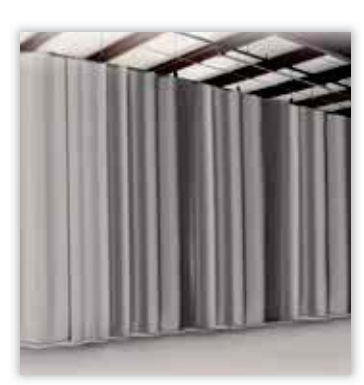
DuraSpan™ Insulated Industrial Curtains