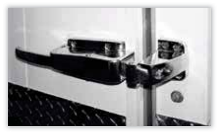
Chrome Plated Latch