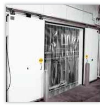
Econo Max® Strip Doors