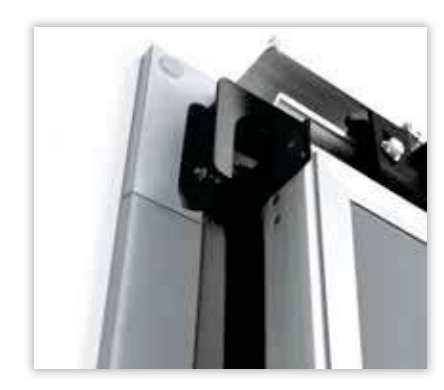
PerfectSeal™ Gasket System