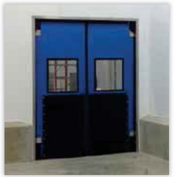
Durulite® Industrial Traffic Doors