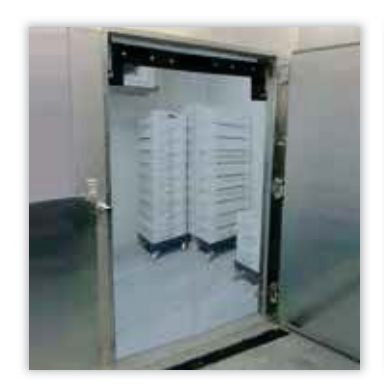
EconoClear™ Flexible Doors