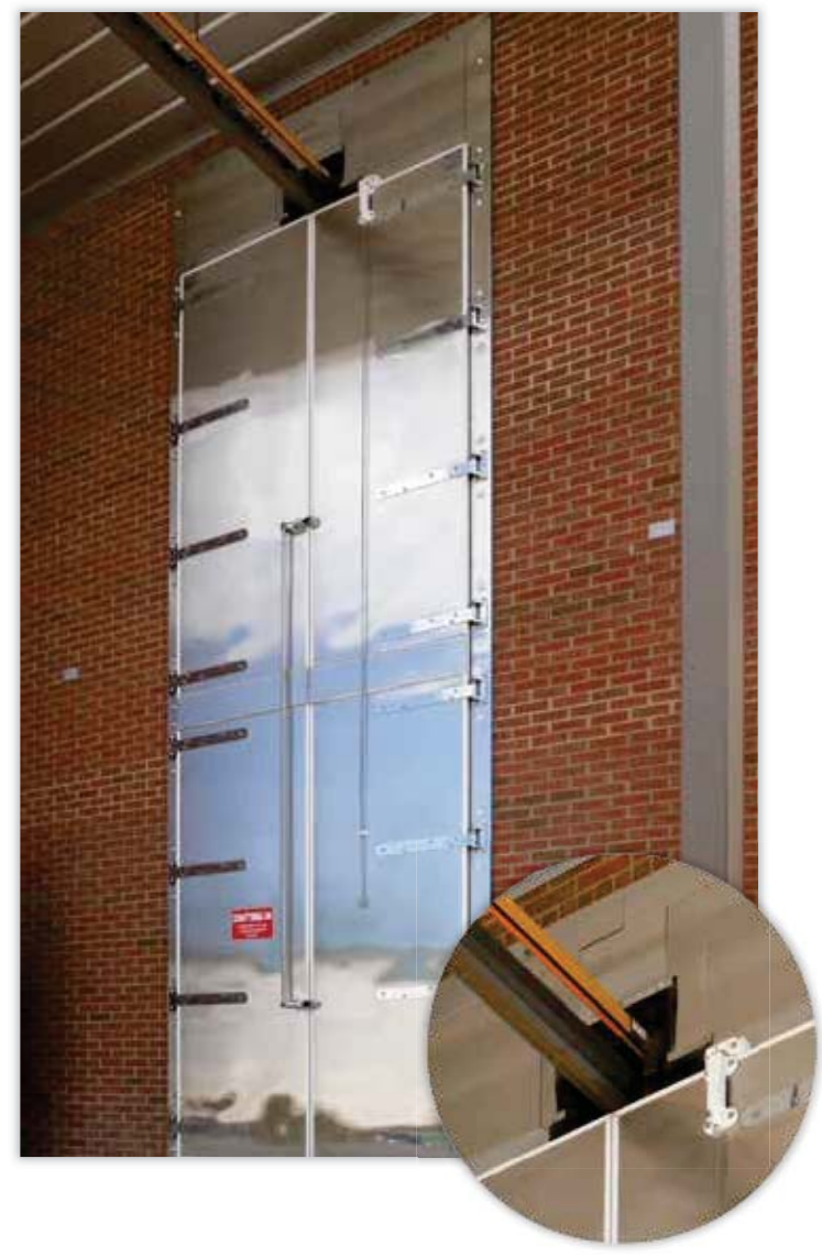
Magnetic Gasket Seal Meat Rail