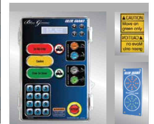
Blue Genius Gold Series III with exterior light and sign