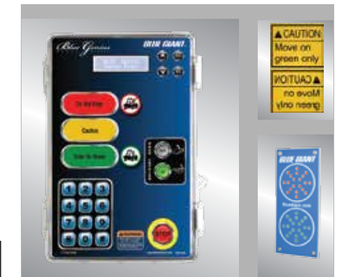
Blue Genius Gold Series I with exterior light and sign