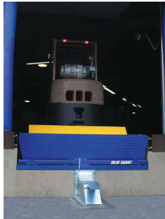
XDS 3000 shown